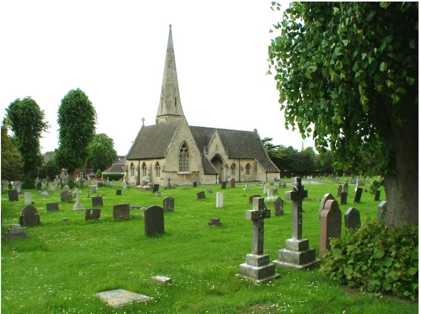
Grantham Cemetery