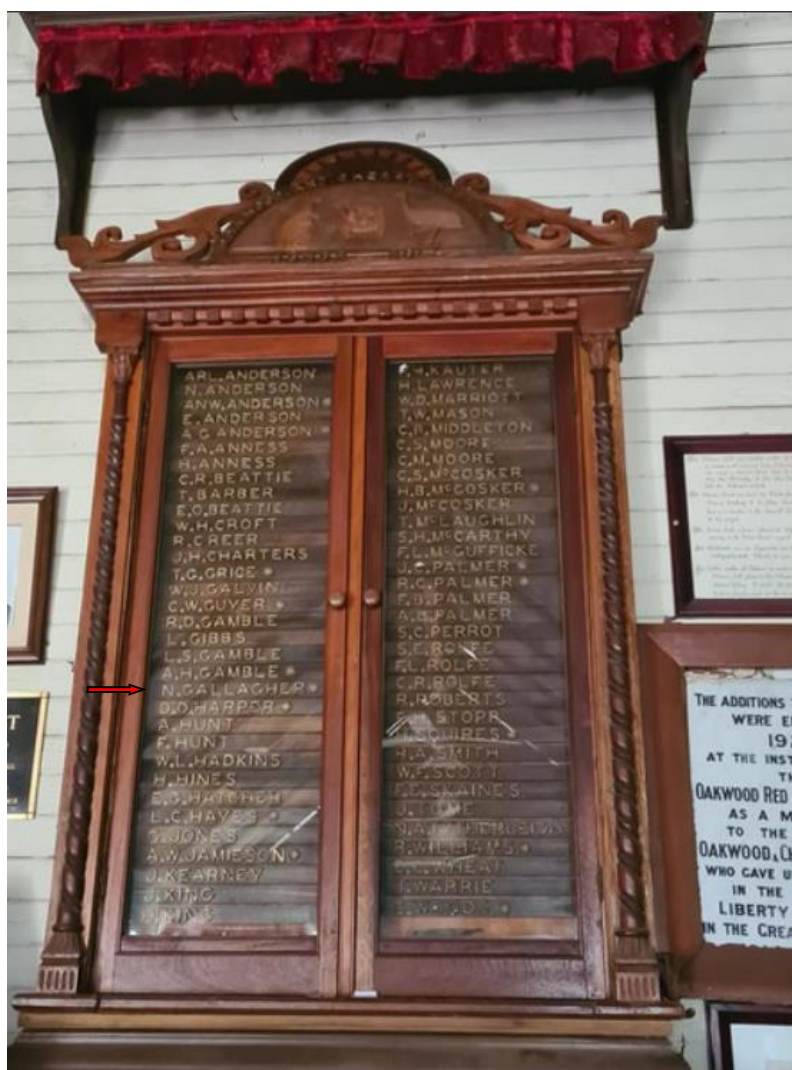
Oakwood & Cherry Tree Hill WW1 Honor Roll

N. Gallagher is remembered on the Oakwood & Cherry Tree Hill WW1 Honor Roll, located in Oakwood Hall, Inverell Pioneer Village, 64 Tingha Road, Inverell, NSW.